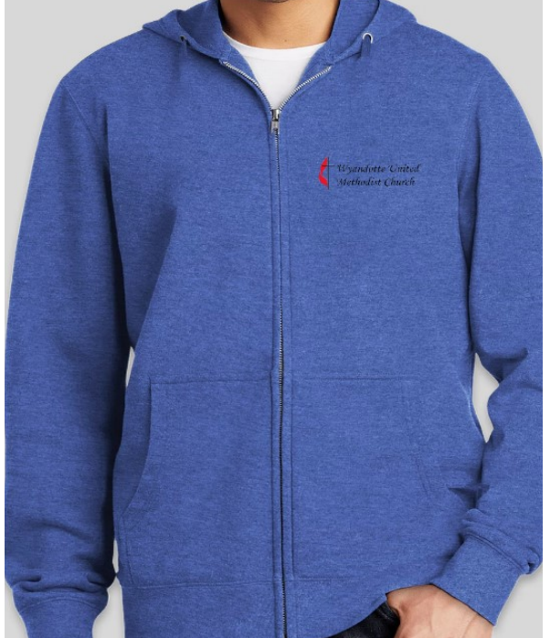
Hoodie 1 ($35-$45)