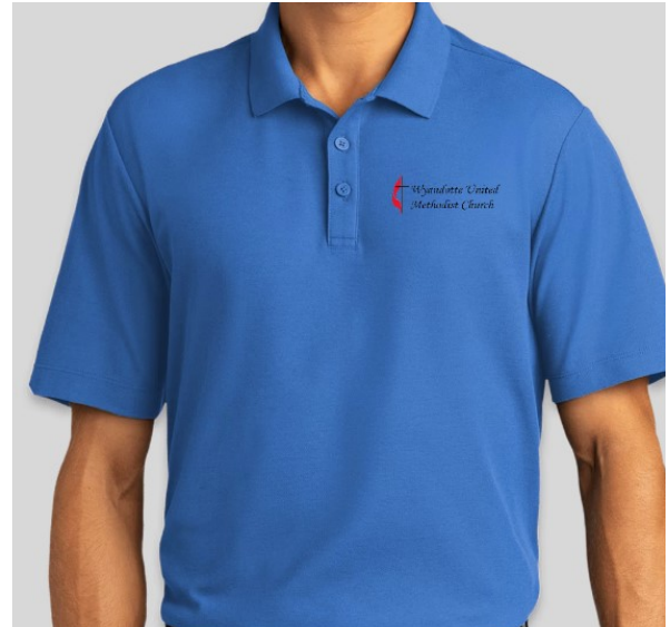
Polo 1 ($25-$35)