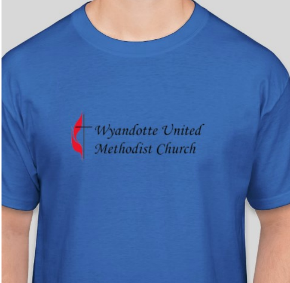
T-Shirt 1 ($15-$25)