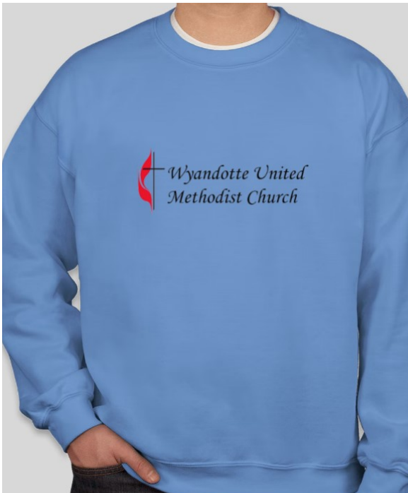
Sweatshirt 1 ($20-$30)